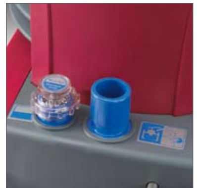
Ventilation connector with excess pressure valve

Oxygen can be added to the air for ventilation if necessary. The connection for air is linked to the oxygen supply so that the attached reservoir bag is filled with oxygen, if needed.