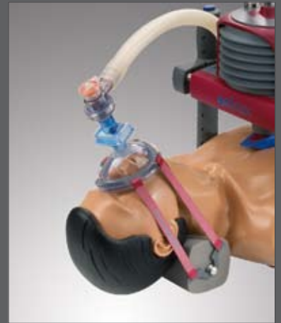
Spiro-set with filter, mask's valve and pressure manometer

The overstretch pillow keeps the patient's head supported and in an overstretched position, while the bow connecting the elastic straps to the mask rotates thus the straps adjust themselves. This assures a particularly good adhesion of the facial mask.