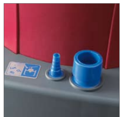
Connector for air and for oxygen supply